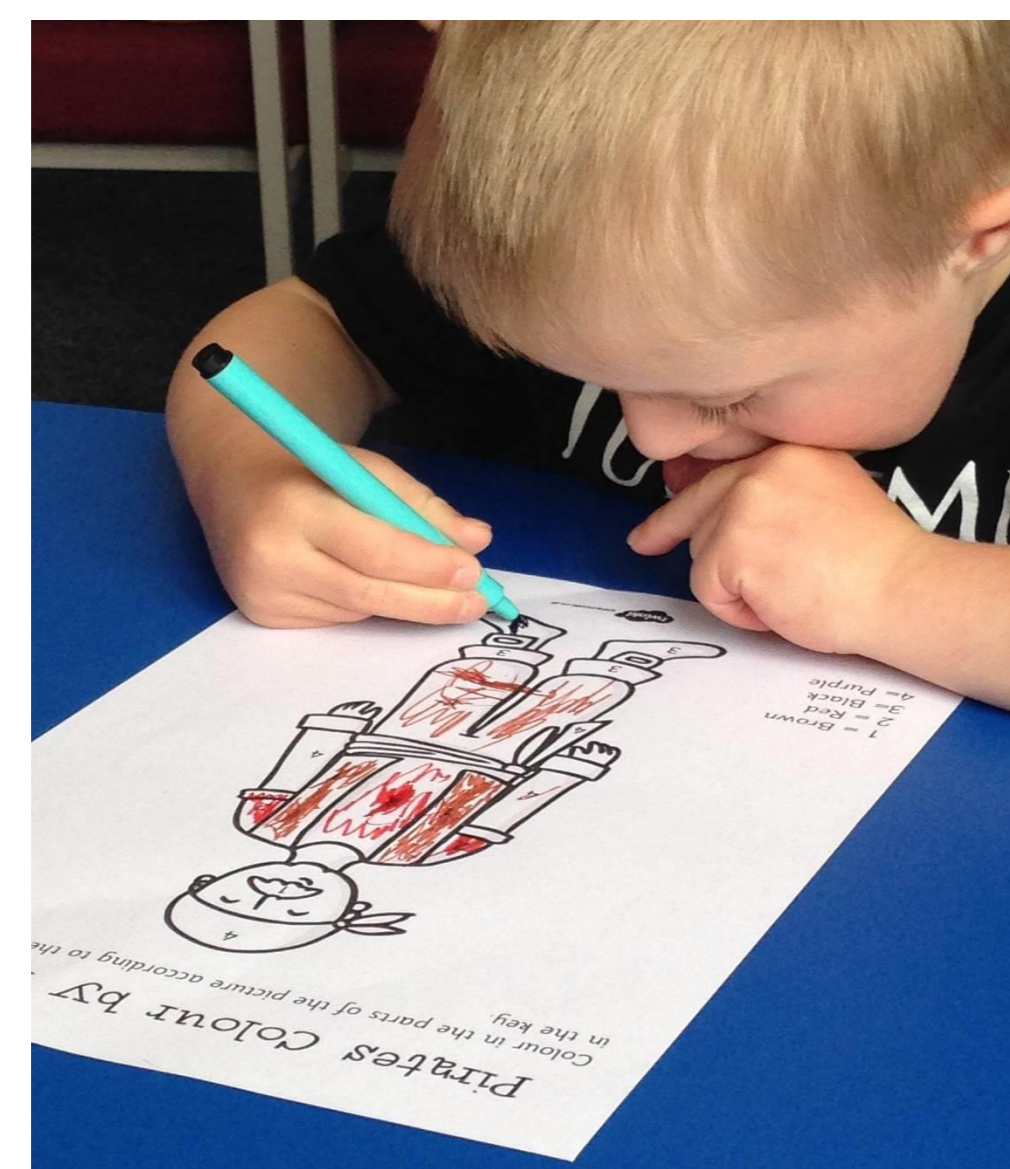
The boy is colouring